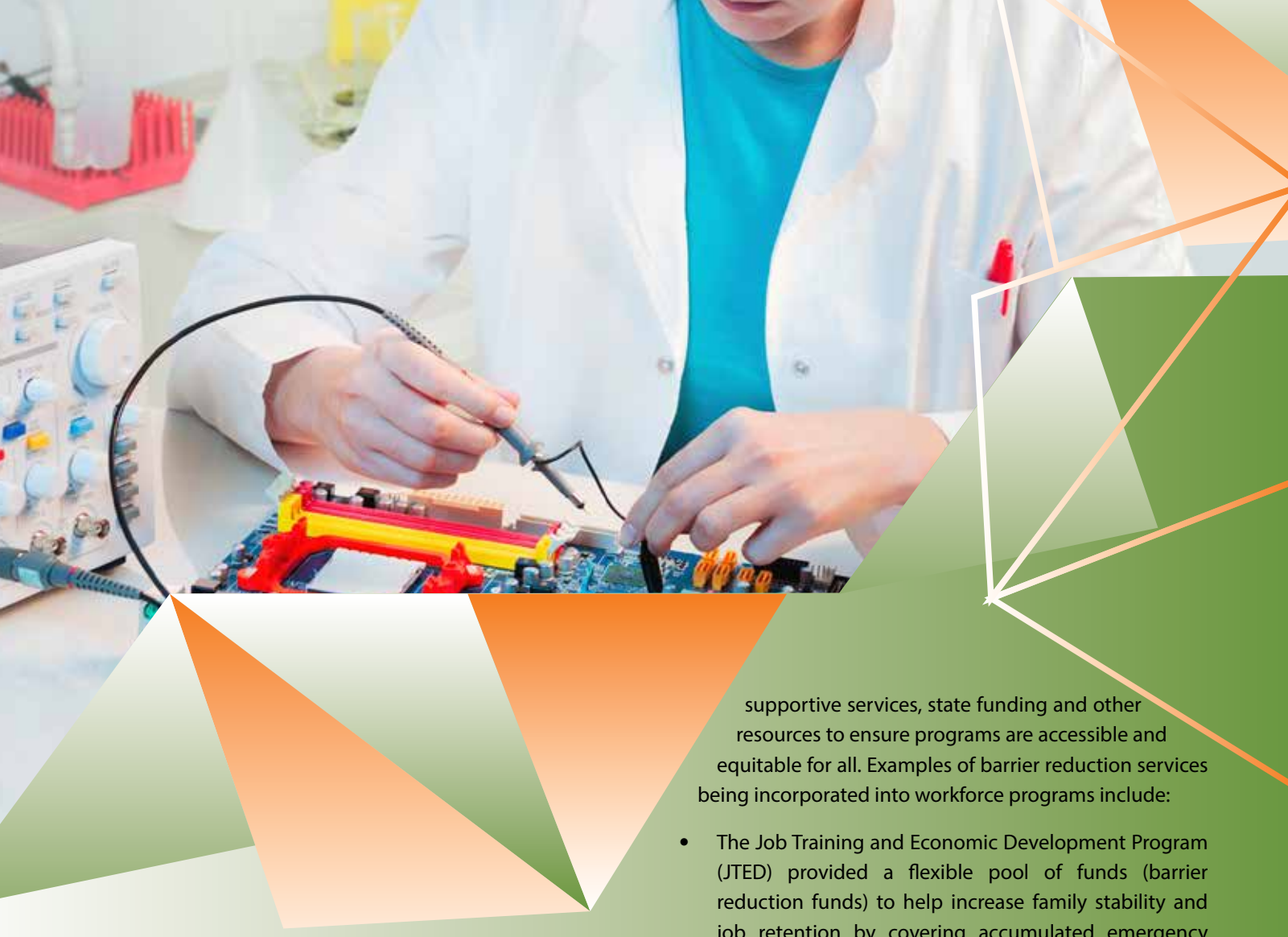
Activity 6.3: Improve the Integration of Program and Case Management Information Systems

The Illinois Data Team's worked with core partners and the Illinois Chief Information Officer, as well as the Illinois Department of Innovation and Technology (DoIT) to improve the integration of program and case management systems was temporarily halted as the Governor's Commission on Workforce Equity and Access developed recommendations around improving data sharing and information systems. The Illinois Data Team began to review the Commission's recommendations for areas where it could assist in operationalizing them.