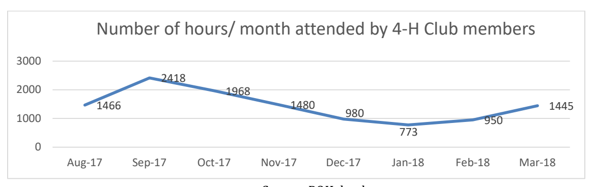
Table 5: Total Number of Hours attended by 4-H Club Members per Month (Aug. 2017 – March 2018)

On the basis of 465 participants registered in 4-H Clubs, the following table shows the total number of hours children attended all 4-H Clubs, during one month or another, between August 2017 and March 2018.