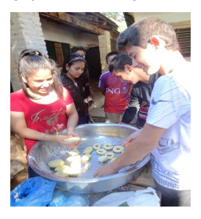
Image 2: Children making chipas in 4-H Club in San Miguel, Villarrica