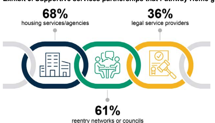
Exhibit 3. Supportive services partnerships that Pathway Home grantees found most critical

Through surveys and group discussions, grantees reported that partnerships were critical to help participants meet their service needs. The three types of partnerships that grantees most commonly cited in the survey as critical to their programming were housing services and agencies (68 percent), reentry networks or councils (61 percent), and legal service providers (36 percent) (Exhibit 3).